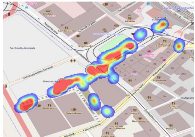
Figure 2 Point density highlighting the spatial positions of users while looking at the mobile paper map.